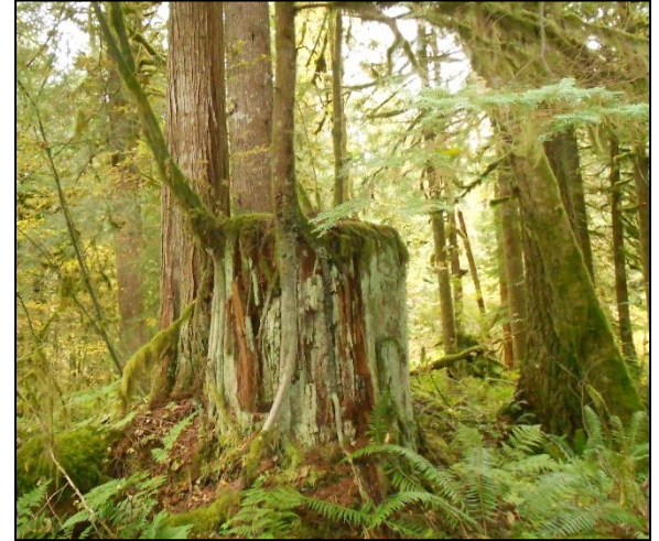
A cedar nurse log, cut more than 50 years ago, supports the growth of seedlings at the Creighton Homestead Girl Scout camp, just east of Zigzag, OR, on the western slope of Mount Hood.

COMMUNITY: Our Western Red Cedar is cut as part of forest restoration projects that are designed to restore the health of the forest by opening the canopy and promoting diversity in tree species and age range. Much of our cedar comes from the Nature Conservancy's Ellsworth Creek Preserve, from the Forest Grove watershed restoration program, and from the Creighton Homestead in Zigzag. After harvest, the wood is cut and dried at a family-owned sawmill near Molalla, OR.